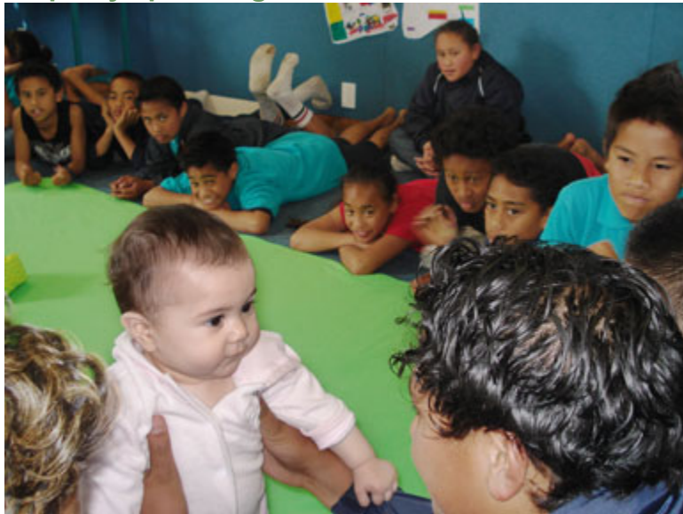
Learning from a tiny teacher in NZ.

In the Southern Hemisphere, where the school year has just begun, Roots of Empathy (ROE) is celebrating a major milestone: our fourth year of operations in a country outside of Canada. New Zealand now has the longest-running international ROE program, which has already reached 4275 children in four years. In 2010-11, we welcome new ROE partner Barnardos one of New Zealand's largest and most trusted children's organizations, as our lead agency in the country. The program was first introduced to 250 children in Auckland in 2007.