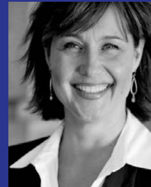
The Honourable Christy Clark Christy Clark Chair, Board of Directors

We realized that children are more stressed and anxious then we've ever seen before. We are seeing poor mental health and well-being. So, Roots of Empathy gave children the opportunity to make sense of what is happening to their lives. In fact, our first lesson was titled: What Happened? Together with the children, we spoke about loss of friendships, of not seeing relatives, loneliness and stress. The teachers reported improvements in children's emotional well-being as they were given opportunities to express how they were feeling in discussion, through their art and through letters that they wrote to the Roots of Empathy baby.